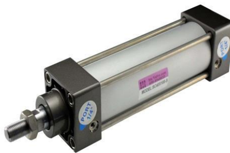
Fig -2: Pneumatic Cylinder