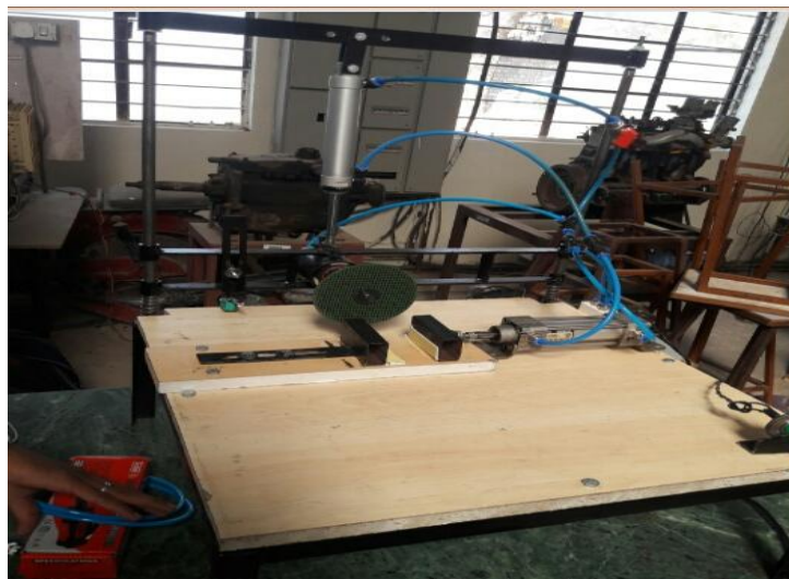
Fig 1:- Pneumatic Pipe Cutting Machine

Today, automation has powerfully entered in the industrial manufacturing process in order to get identical and accuracy of each product by reducing the human involvement. Automatic production is carried out for mass production which is aim at reducing the manufacturing cost of a product. Automatic pipe cutting machine is one of the machines use for bulk production and targets at decreasing the human involvement in order to increase the productivity and accuracy of the product.