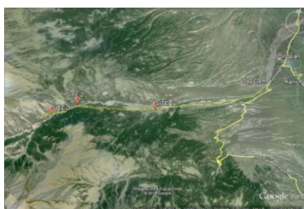
Fig. 1 Location of examined sites in the study area.

The present study was conducted on the forest soils of Hirpora wildlife sanctuary, which is located in Shopian district, 70 km to south of Srinagar Kashmir. Three study sites were selected viz. Site I (Hirpora village), Site II (Dubjan) and Site III (Sukh Sarai) in order to study the physico-chemical properties of soil (Fig. 1). The study sites were selected at different aspect, topography, vegetation and varied visibly for the purpose of comparison.