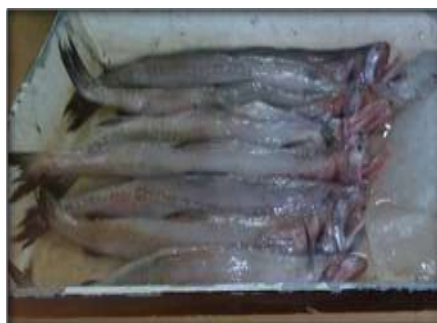
Fig 2: Fresh species of Harpodon nehereus collected from popular fish landing center, Sassoon dock, Mumbai