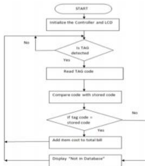
Fig.2. flowchart of the program